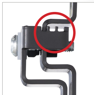
Integrated adjustment guides help align rails