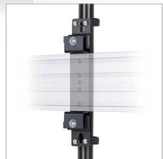
Can also be pole mounted using B-Tech accessory collars